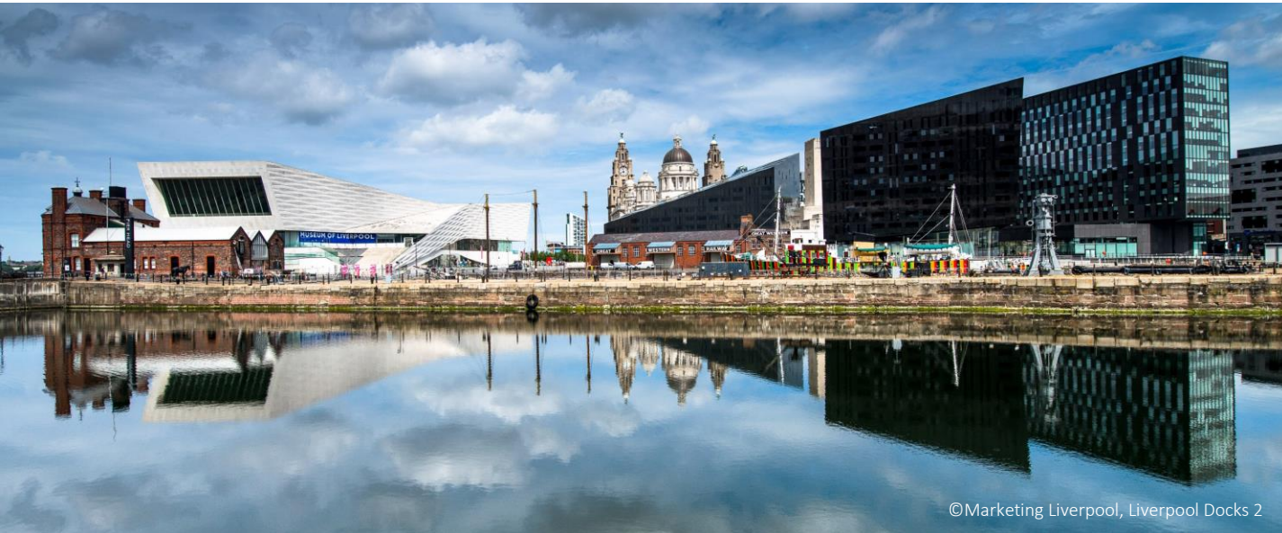
Liverpool Docks 2

Liverpool is a city with unique attractions, exciting events, world class sport offerings, unrivalled musical heritage and a famously warm welcome!