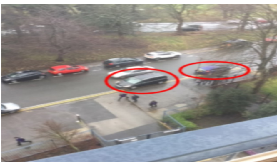
More examples of poor parking that may endanger our students, staff and neighbours