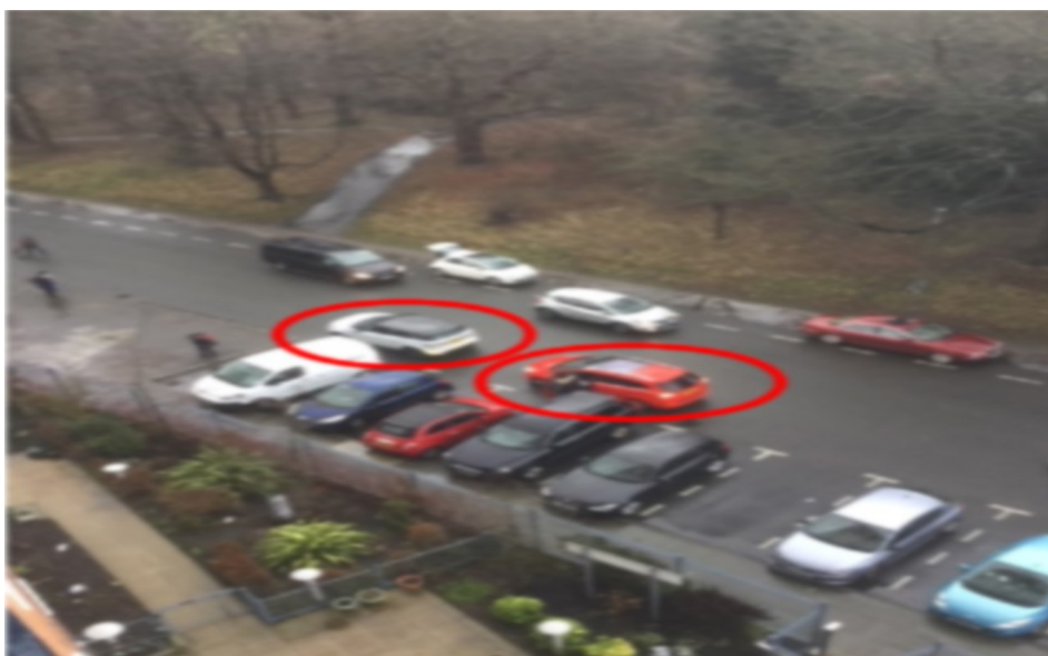
Cars parked/ stopped on a busy road and blocking in resident cars