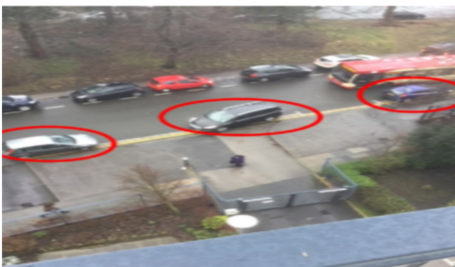
Cars parked on double yellow lines and blocking an entrance to our neighbours