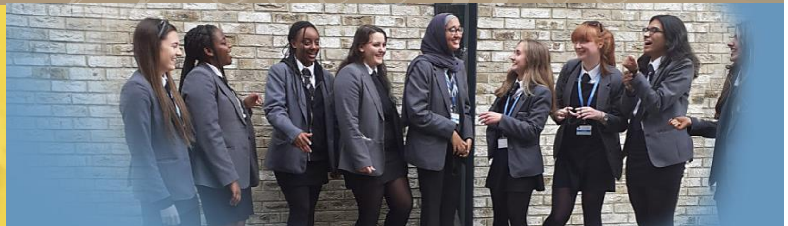
College Leadership Team - L-R: